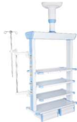
SK-P026 Rotary Surgical Pendant (Electric Height Adjustable)

Parameter : (Price/Meter) Working Power: Customization Loading capacity: \leq 150\text{kg} Different color outlet prevent connect wrong Insert and pull out more than 20000times Electrical socket: according to drawbridge length Infusion hook: according to drawbridge length