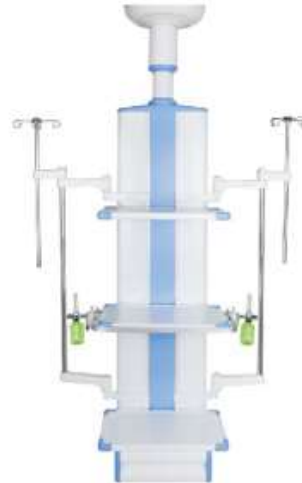
SK-P010 Medical Multi-function Column

Use: General use, Suction ceiling installation. Material: Use aluminium alloy material Surface use powder-coated treatment