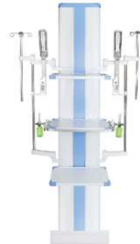
SK-P011 Medical Floor Stand Column