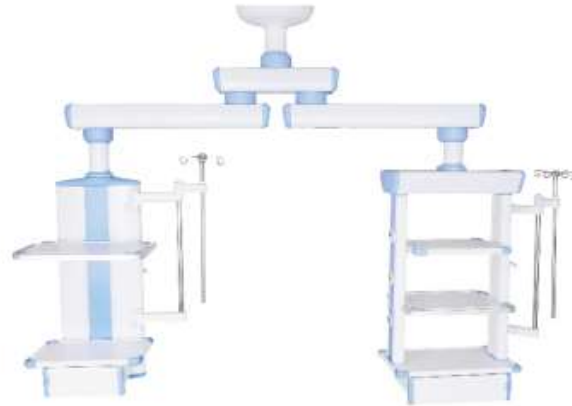
SK-P008 Double Arm Electric Surgical pendant

Use: Operating room, Suction ceiling installation. Material: Use aluminium alloy material Surface use powder-coated treatment