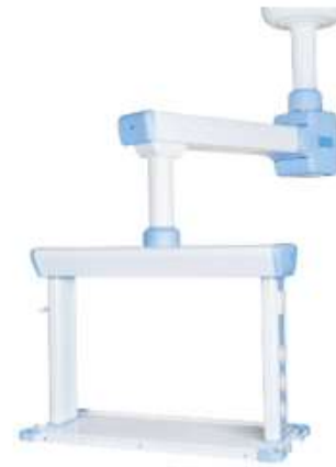
SK-P027 Rotary Surgical Pendant (Fixed Height)