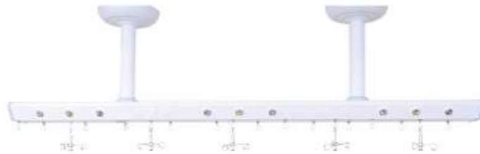
SK-P007 Infusion Rails System

Use: ICU/Infusion room, Suction ceiling installation.