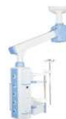
SK-P013 Single Arm Electric Surgical Pendant