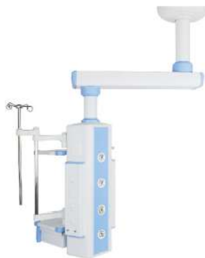
SK-P014 Single Arm Surgical Pendant(Adjustable Height)

Use: Operating room, ceiling type. Material: Use aluminium alloy material Surface use powder-coated treatment