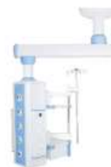
SK-P018 Single Arm Surgical Pendant (Adjustable Height)