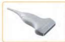
LH75– Linear probe