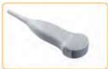
C520– Microconvex probe