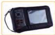
leather protector (easy-clean by running water)