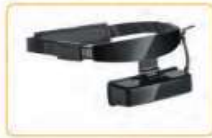
I-Scan® V2 Video Goggles