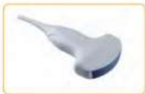
C350– Convex probe