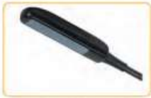
Rectal linear probe