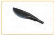
RC40V– Rectal convex probe